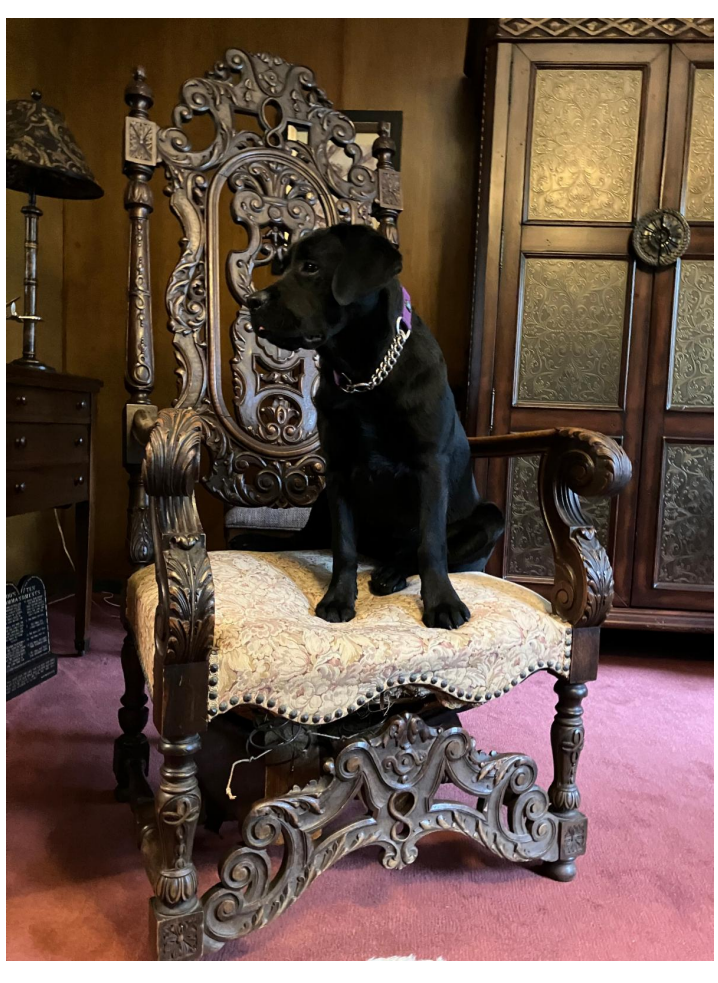
FROM THE FORGOTTEN CABINET