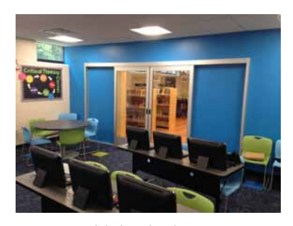
Remodeled Technology Center Funded by the 2014 September Spectacular Paddle Raise