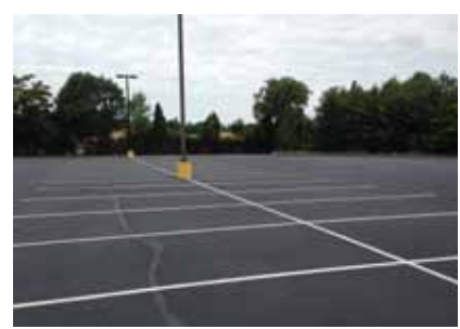
The parking lot of Byrider Hall was sealed and striped