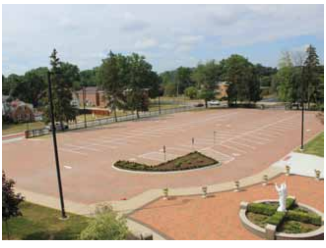
The Completed New Brick Parking Lot! Funded by the generous donors to the Brick Fund and the Rooted in Faith Campaign