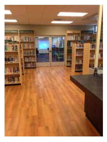
Hamlin Library received a new floor and is now connected to the Techology Center