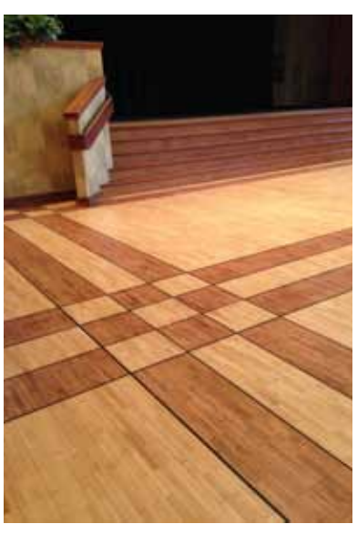
Refinished Zwisler Hall floor