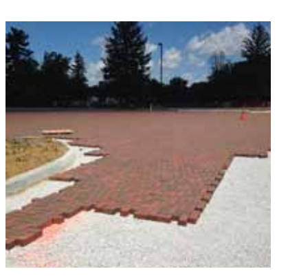
Construction view from the entrance, looking towards the playground.