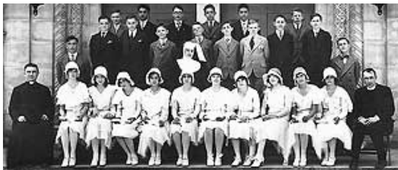
The Class of 1930, the first graduating class from St. Sebastian Parish School.