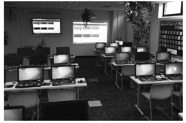
Remodeled Technology Center Funded by the 2014 September Spectacular Paddle Raise