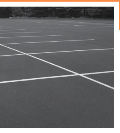
The parking lot of Byrider Hall was sealed and striped